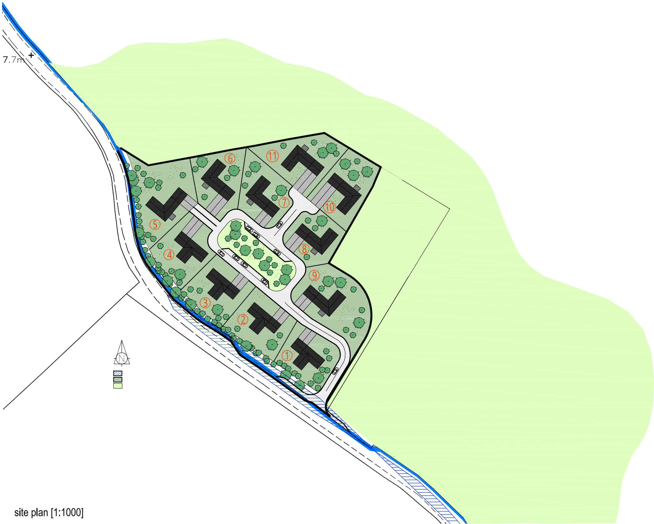
site plan [1:1000]

Unless otherwise assigned, the copyright of this drawing is reserved by Slorach Wood Architects and is issued with the caveat that it is not copied or disclosed to any third party, either wholly or in part, without the written permission of Slorach Wood Architects. Variations and modifications to work shown in this drawing should not be carried out without written permission of Slorach Wood Architects, who accept no liability whatsoever for alterations made to this drawing by any third party other than themselves. All works to comply in every respect with the current Scottish Building Standards Regulations (Scotland) Regulation 2004. All works to comply with the relevant Codes of Practice and British Standards and shall be carried out to the highest standard of craftsmanship by skilled and qualified persons of the respective trades and in accordance with good building practice. The contractor shall be responsible for making contact with the respective statutory authorities and establish the location of all existing services. The contractor shall ensure compliance with the Local Authority regulations. Do not scale from this drawing at any time. Use figured dimensions only. All setting out dimensions are to be confirmed prior to the commencement of any associated works, with any discrepancies reported to the architect immediately. All dimensions are to the structure and exclude any plaster/plasterboard finishes.